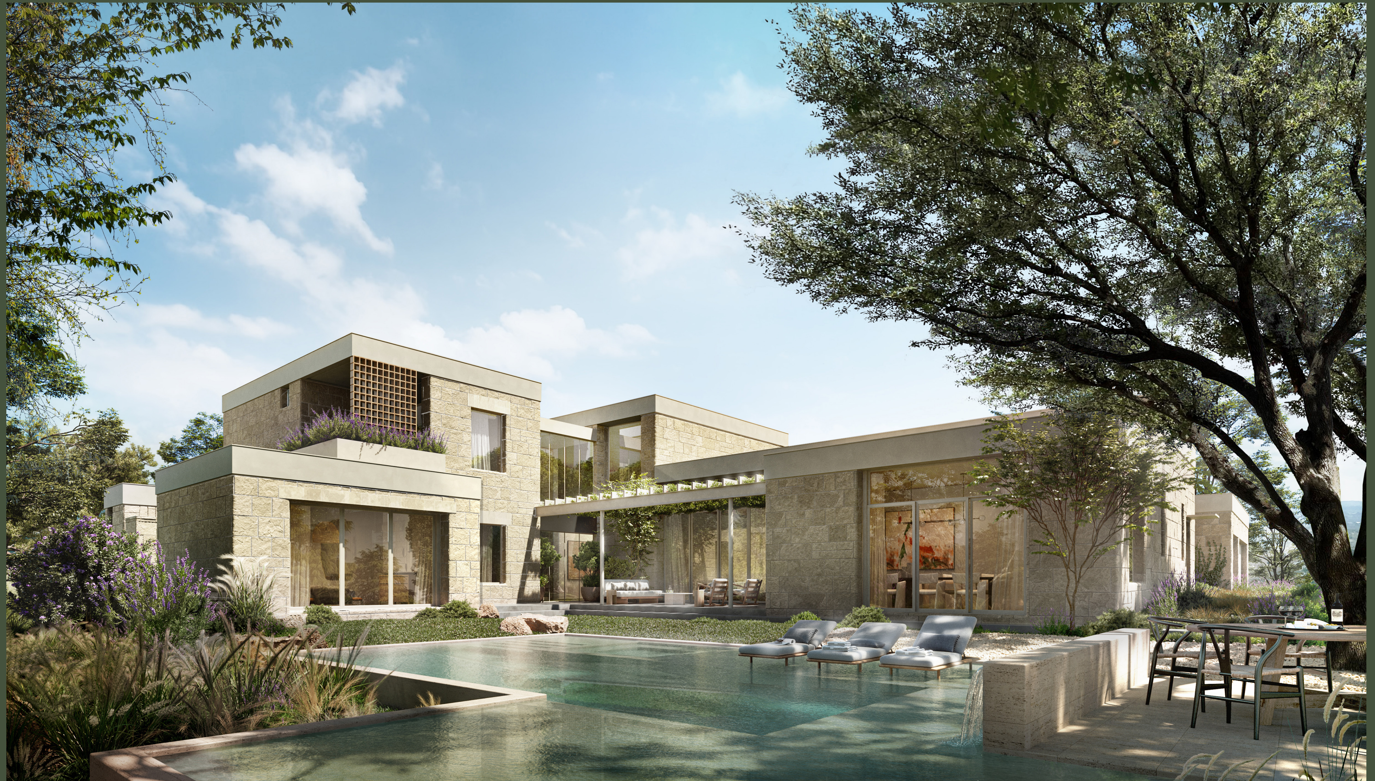
Mayfield Estate Two Story Modern pictured above to show general design intent for Estate Homes.